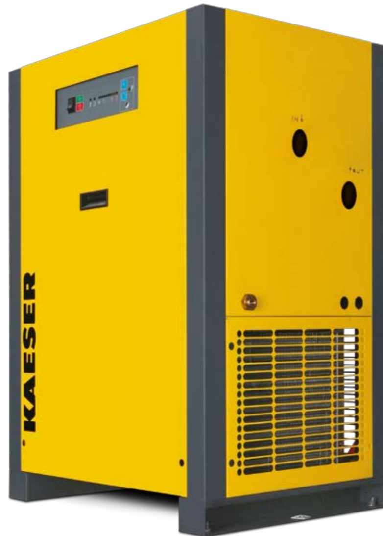
Standard version THP 40-50